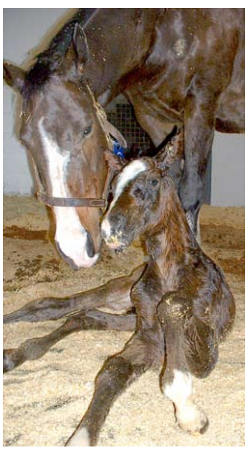
This newborn foal is about five minutes old.

births is the "neonatal maladjustment or dummy foal" syndrome. This syndrome can be caused by a short period of time during the birthing process that the foal does not receive enough oxygen. The lack of oxygen causes the mental abilities of the foal to be diminished for up to a few days. The lack of oxygen could be caused by blocked airways