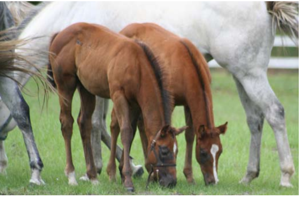
Foals raised in a pasture and in groups for socialization.

monitoring her for birth of the foal. The foal alert allows us to be at the mare's side within two minutes of the time the birth process begins.