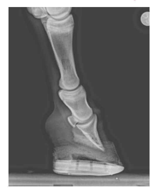
A radiograph of a foal post check ligament desmotomy surgery. He has a shoe on to keep him from wearing off his toe. Many times careful daily monitoring of the foals can decrease the need for corrective surgery.

pregnancy the demands of the developing fetus cannot be met if the mare is on a marginally adequate or inadequate diet.